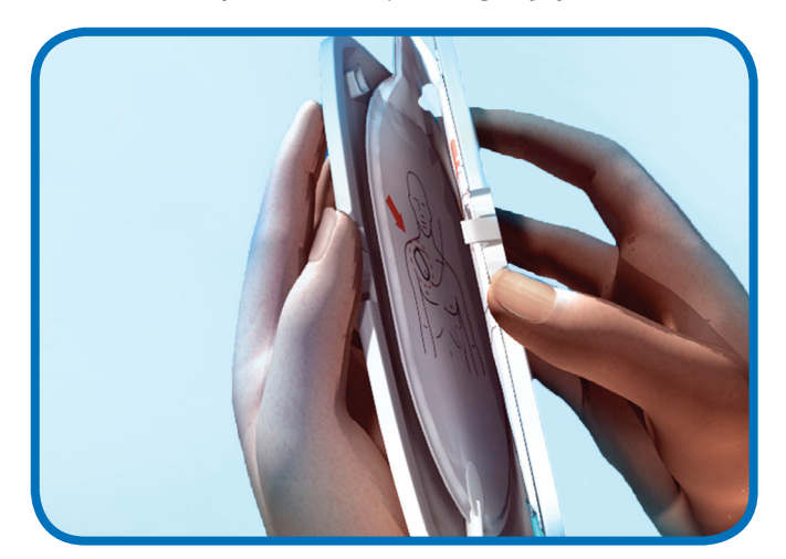
3. Place the pads on the patient`s clean and dry chest as directed.

2. Take the pads out of the grey pads case.